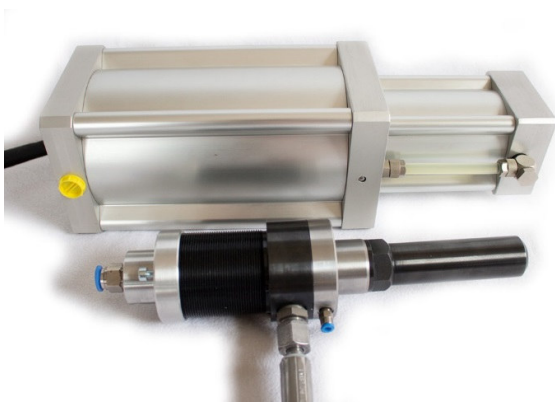
Rivet tool and pressure booster