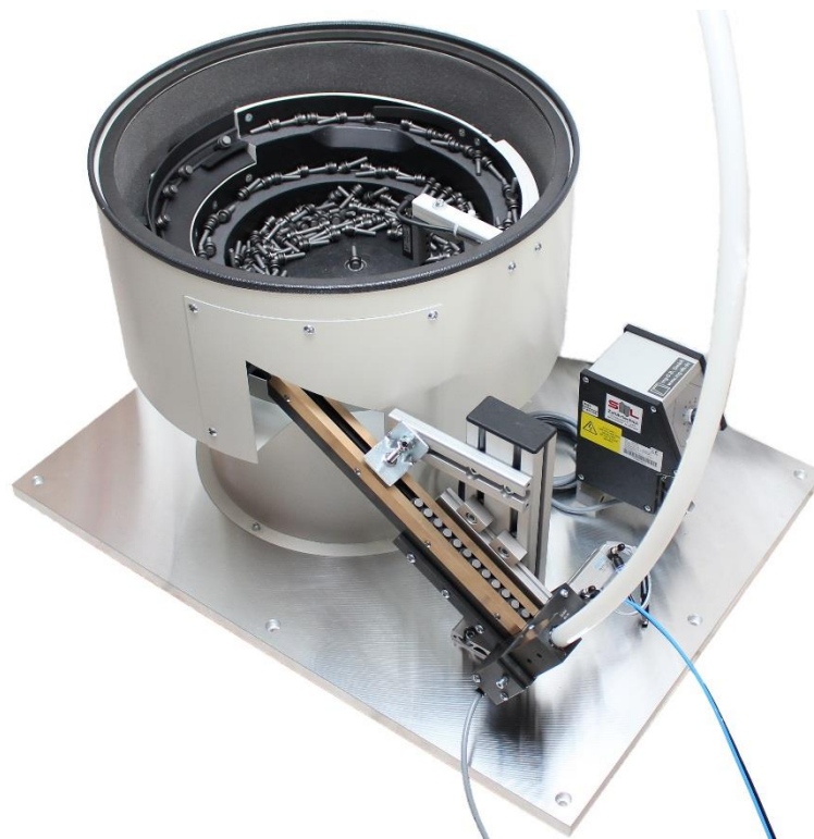
Feeding system with feed section and separation