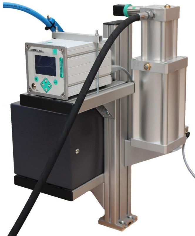
Process monitoring, pressure booster and mandrel container