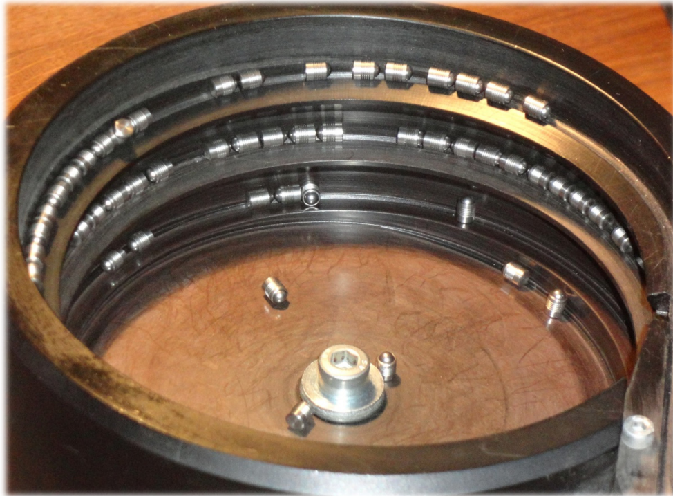
Feeding system ball plug \varnothing 5 mm