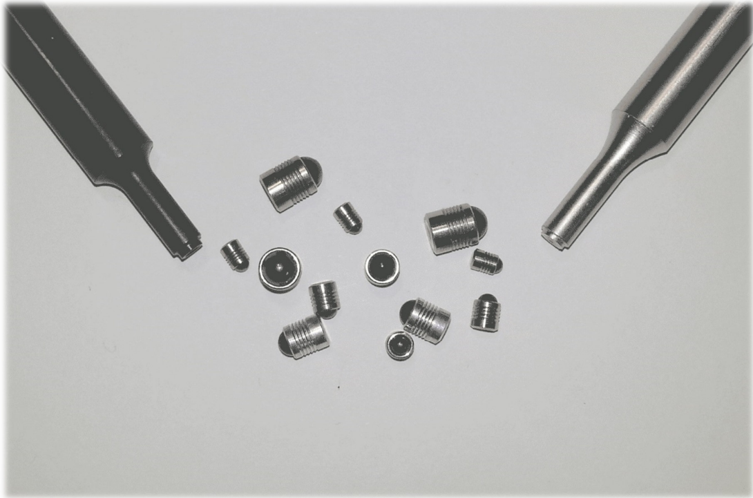
Ball plugs and installation tools